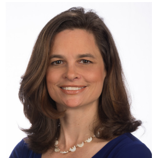
President & CEO